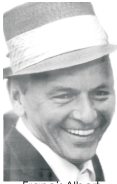
Francis Albert Sinatra

He's no Diesel (the winner of last month's award), but he sure kicks butt, too. I know, I know, you're all saying, "this guy doesn't even wrestle". I know! Bobby Heenan doesn't wrestle either, but you can't say he isn't funny. Frank has been around since 1915 just 'a singin' and 'a dancin' and I think he's great. When I die, I'm having "My Way" played at my funeral. Besides, I couldn't think of any wrestler that deserved this honor besides Deisel.